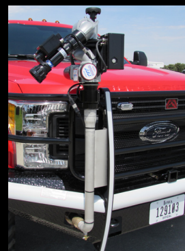
Front Bumper Turrets