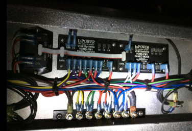
Multiplexed Wiring System