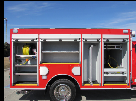
Maximized Compartment Space