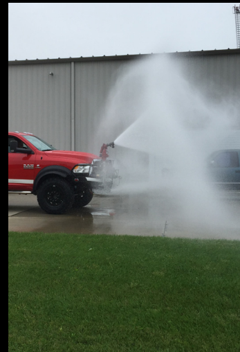
Ground Sweeps and Turret in action