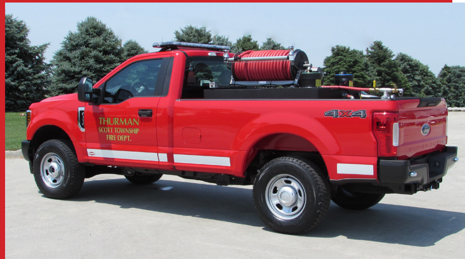
Pickup Mounted Skid