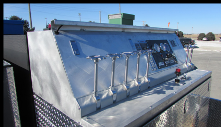
Top Mounted Controls