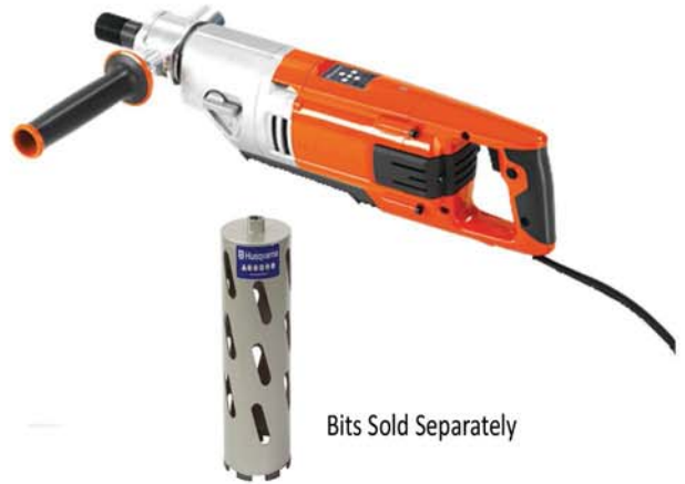
Bits Sold Separately

Husqvarna 2.3 hp. Handheld 110-volt electric core drill for both dry and wet drilling. The TDM 220 has an ergonomically designed D-handle that gives you good control while drilling. Handheld core drilling up to 3 in. Suitable for light applications such as pilot holes for search cameras, ventilation and most rescue operations. Works well in confined spaces with optional electric vacuum dust reducer. An excellent choice for professional search and rescue operations.