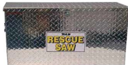
FULL SIZE ALUMINUM