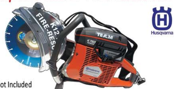
Blade Not Included

The Partner - Husqvarna K12FD74 is a high performance lightweight rescue saw featuring Husqvarna's 5.7 hp (74 cc) X-Torq air-cooled 2-stroke gas engine with smartCarb, DuraStarter, Ready Start ignition, "D" ring pull start, decompression valve, 12" Chrome guard with reflective lettering, welded "D" ring for included equipment sling. Cutting depth 4", Weight 21 lbs.