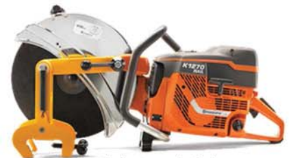
Blade Not Included