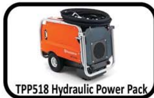
TPP518 Hydraulic Power Pack