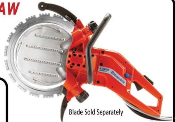
Blade Sold Separately

The Husqvarna K 3600 MK II Hydraulic Ring Saw with rim drive system can make a 10.6" deep concrete cuts with a 14" blade. This 18.3 lbs. light weight cutter will make easy work of the toughest concrete cutting while producing no fumes at low noise levels. Ideal cutter for any heavy rescue, US&R, Task Force, disaster response equipment cache. * Wet concrete cutting only. * Blade and Hydraulic power supply required