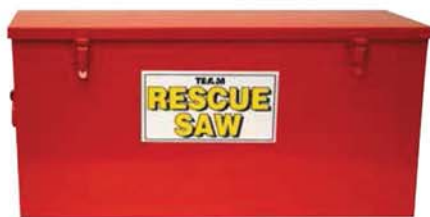
FULL SIZE STEEL