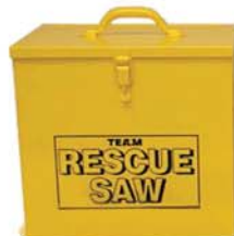
SPACE SAVER STEEL