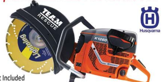
Blade Not Included

The Partner - Husqvarna K12FD119 is strongest handheld rescue saw on the market. Featuring Husqvarna's 7.8 hp (119 cc) 2-stroke gas power house with advanced features providing reduced wear, better fuel economy and performance. 16" black guard with reflective lettering and "D" pull start. Cutting depth 6", Weight 30 lbs.