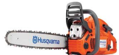
Wood Cutting Chainsaws

T576XP20BDL Husqvarna 76cc Chainsaw Bundle: 2 = 20" Bars & Chains, 4 = 2-Cycle Oil, 1 = Stabil, 1 = Bar Oil. T576XP24BDL Husqvarna 76cc Chainsaw Bundle: 2 = 24" Bars & Chains, 4 = 2-Cycle Oil, 1 = Stabil, 1 = Bar Oil. T576XP28BDL Husqvarna 76cc Chainsaw Bundle: 2 = 28" Bars & Chains, 4 = 2-Cycle Oil, 1 = Stabil, 1 = Bar Oil. T390XP20BDL Husqvarna 88cc Chainsaw Bundle: 2 = 20" Bars & Chains, 4 = 2-Cycle Oil, 1 = Stabil, 1 = Bar Oil. T390XP24BDL Husqvarna 88cc Chainsaw Bundle: 2 = 24" Bars & Chains, 4 = 2-Cycle Oil, 1 = Stabil, 1 = Bar Oil. T390XP28BDL Husqvarna 88cc Chainsaw Bundle: 2 = 28" Bars & Chains, 4 = 2-Cycle Oil, 1 = Stabil, 1 = Bar Oil.