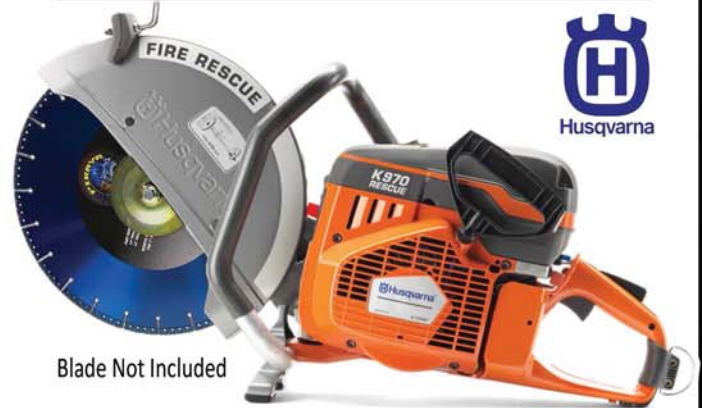
Blade Not Included

TEAM Partner - Husqvarna K12FD94 bestselling all-around primary rescue saw with the best power to weight ratio and unlimited cutting capability. Featuring Husqvarna's 7hp (94cc) 2-stroke advanced technology X-Torq air-cooled gas engine. Equipped with smart carburetor and active air filtration for constant air intake monitoring to automatically adjust fuel mixture assuring maximum cutting performance. With a new cylinder design and digital ignition providing optimum performance with 5% greater fuel efficiency. New Smart-Tension belt tensioner, lightweight 14" steplessly adjustable magnesium blade guard with reflective stripes and "D" rings for attaching included equipment sling. Decompression valve and large "D" ring handle on the sealed Dura Starter provides a 50% reduction in starter pulling force. The NEW K12FD94 provides improved ergonomics, reliability and performance. Maximum cutting depth 5", Weight 24 lbs.