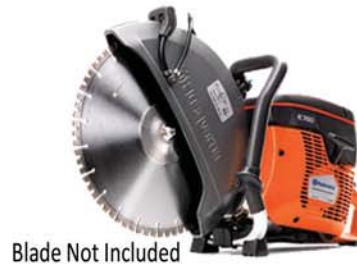
Blade Not Included

9714A K970 Active 14" 7 hp Saw only 9716A K970 Active 16" 7 hp Saw only 1264A K1270 Active 14" 7.8 hp Saw only 1266A K1270 Active 16" 7.8 hp Saw only 1276RAIL K1270 Active 16" 7.8 hp Saw With Rail Arm 7612 K760 Active 12" 5.7 hp Saw only 7614 K760 Active 14" 5.7 hp Saw only