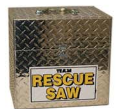
SPACE SAVER ALUMINUM

FC6570M Full Size Steel Case (all circular saws except K1270's & 16" saws) 34"L x 12"W x 18"H 37 lbs. ALC200FD Full Size Aluminum Case (all circular saws except K1270's & 16" saws) 35"L x 14"W x 18"H 43 lbs. ALC300FD Full Size Aluminum Case (fits larger saws like K1270's & 16" saws) 37"L x 13"W x 19"H 45 lbs. SC3000 Full Size Aluminum Case (fits chainsaws only, no circular saws) 41"L x 15"W x 16"H 40 lbs. SC2015 Space Saver Steel Case (all but 16" saws) 15"L x 12"W x 16"H 21 lbs. SC1515 Space Saver Aluminum Case (all but 16" saws) 16"L x 12"W x 16"H 21 lbs.