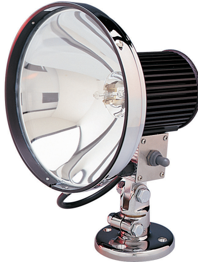
Above photo depicts both the CD-FX-9 and CD-FX-12 models.